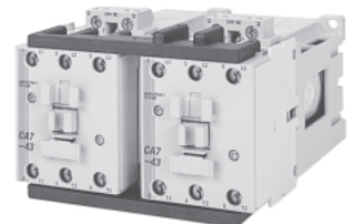
CAU7-43C-02 reversing contactor

NOTE: DC and AC coils are not interchangeable. CA7-9C...43C contactors have increased dimensions to accommodate DC coils. CA7-60D...85D contactors have a two winding coil with built-in late break auxiliary contact and coil suppression. Refer to page A39 for dimensions.