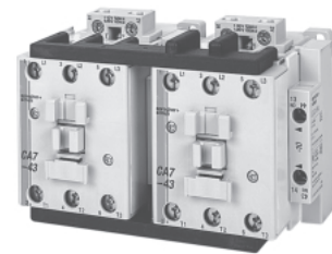
CAU7-43-22-120 reversing contactor